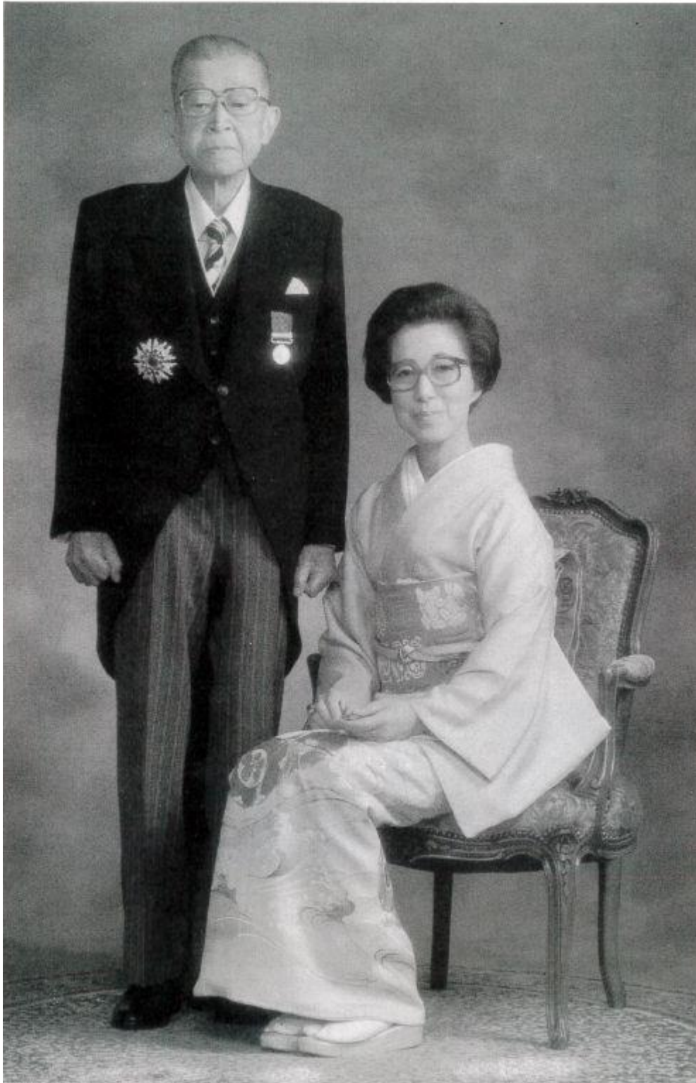
After the conferment ceremony for the Second Class Order of Sacred Treasures (November 1988)