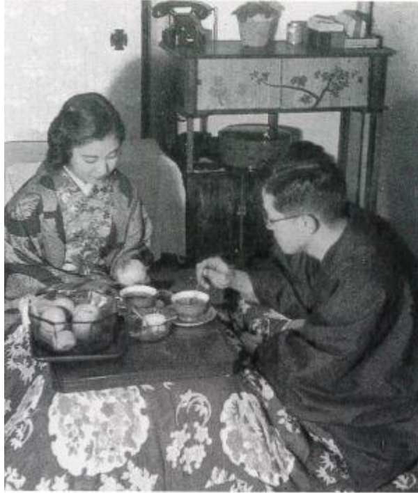
In newly married days (at the company-owned house of Nissan Liquid Fuel, December 1942)