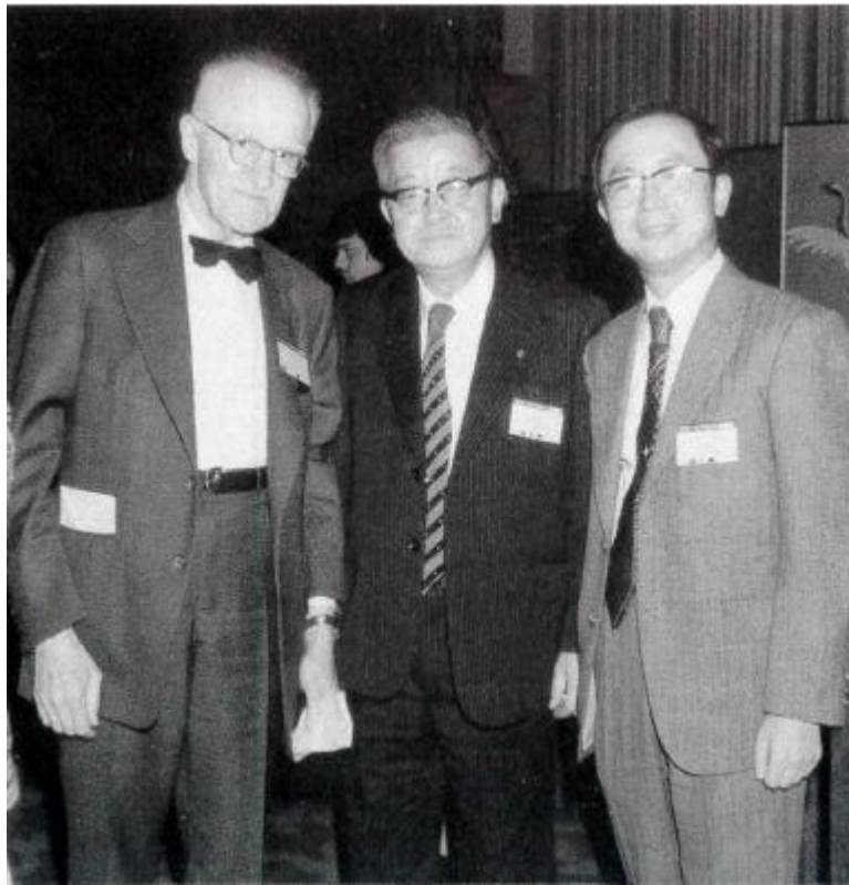
With Dr. Juran and Prof. Hitoshi Kume (ICQC'78 TOKYO, 1978)