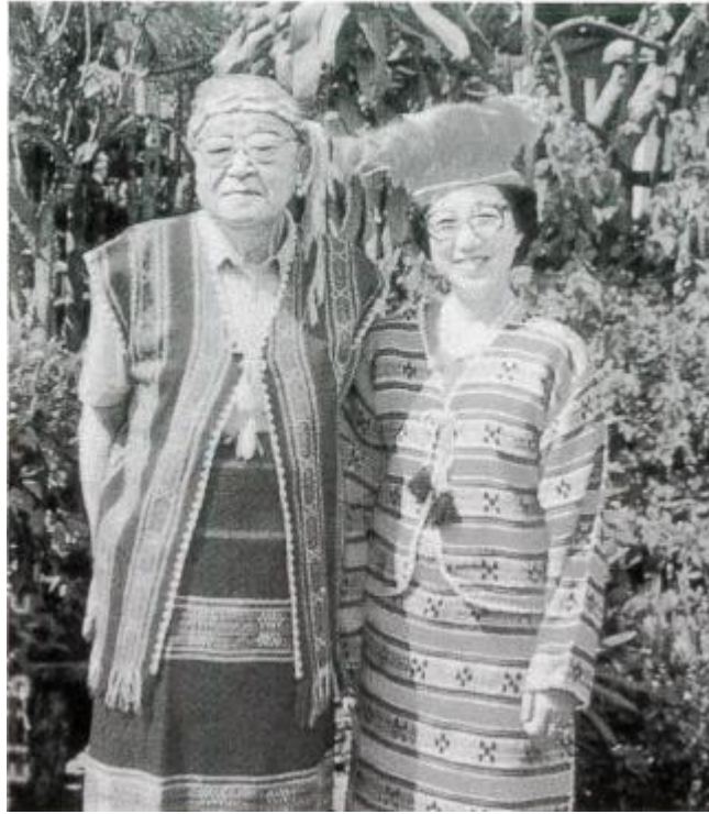
At the time of visit to the alumni association of Musashi Institute of Technology in Taiwan (Summer, 1986)