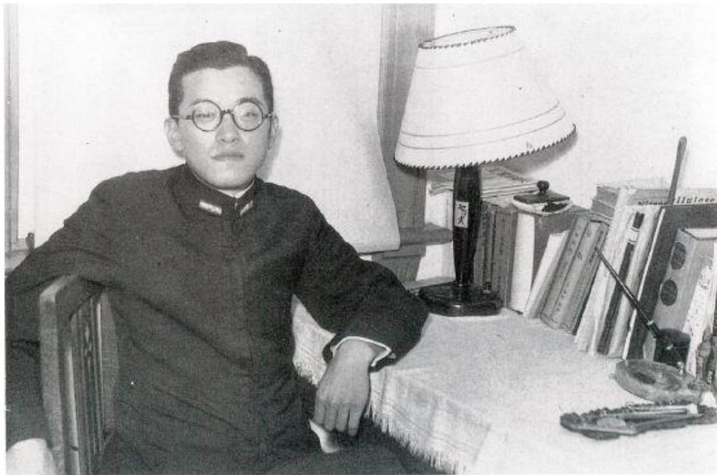
During his time in Navy as an ordnance lieutenant, in his private room at the quarters. (circa 1941)