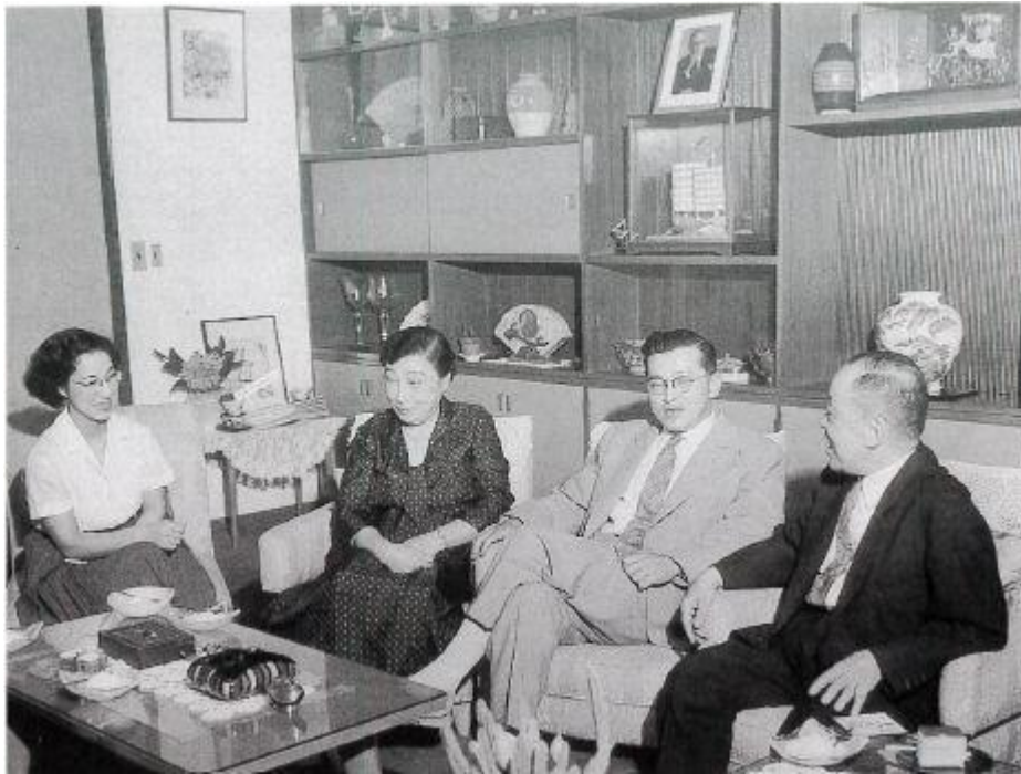
With his parents (at the residence, September 27, 1959)