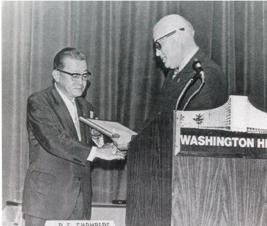
Awarded the Grant Medal from ASQC for the year 1971 (Washington, D.C., 1972)