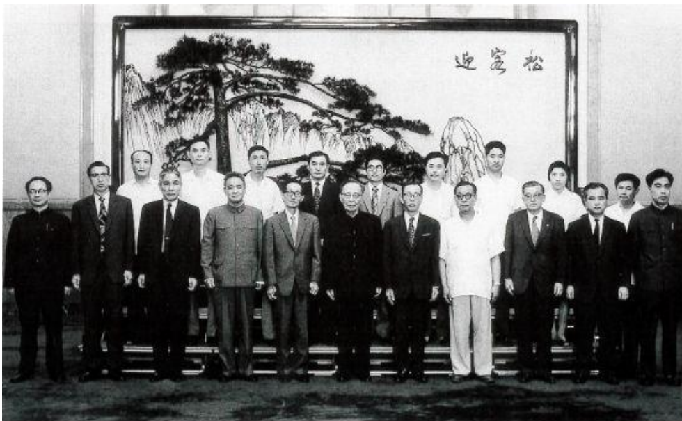
Visited China as a member of the standardization and technology exchange mission dispatched by Ministry of International Trade and Industry (at the Great Hall of the People). Front row center is Guo Moruo, Vice Chariman of the National People's Congress, and Honorary Chairman of the China Japan Friendship Association (1973)