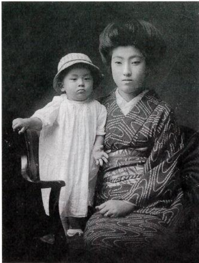
After turning 1 year old (September 1916)