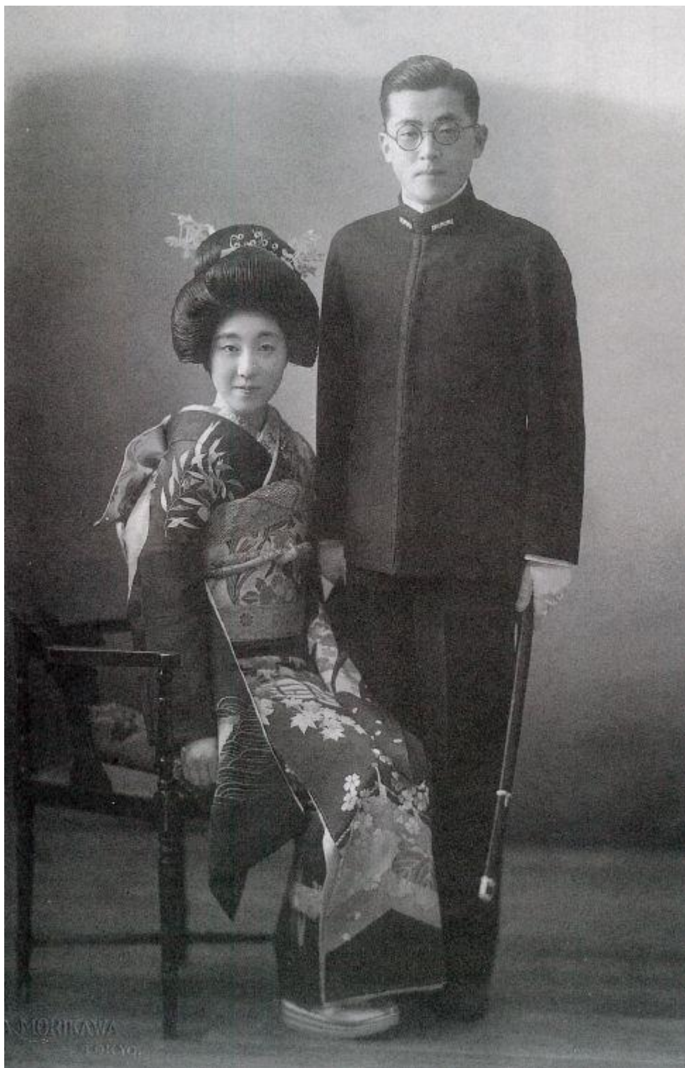
Wedding Photo (February 11, 1942)