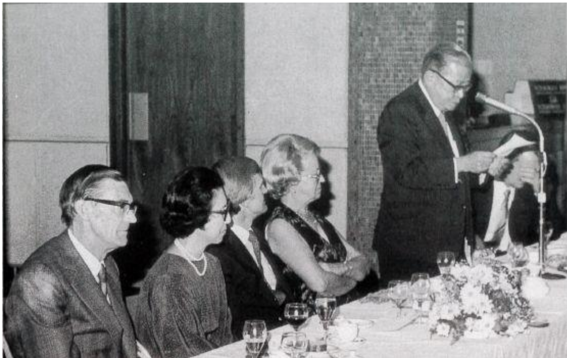
Delivering a speech at the party of ISO/TC 102 (October 1980)