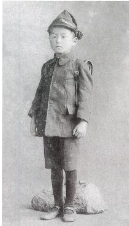
Entering the elementary school attached to Tokyo Higher Normal School (Spring, 1923)