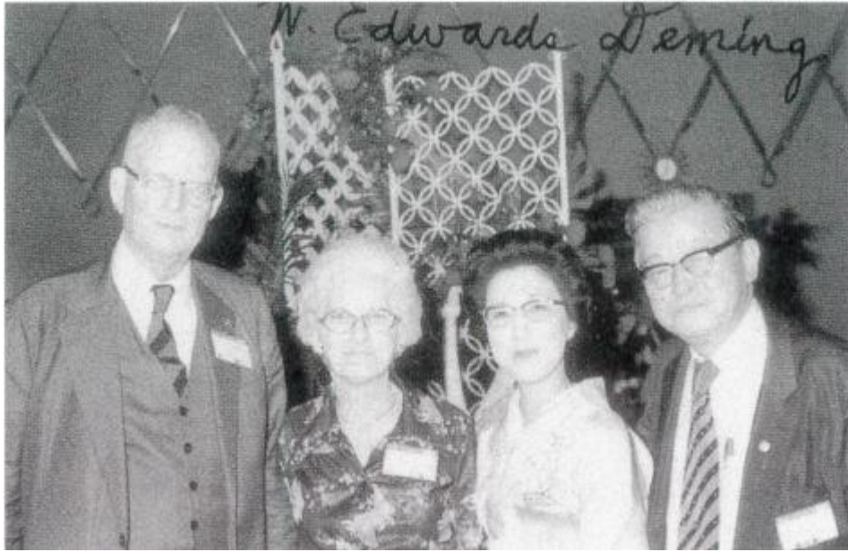
With Dr. Deming and his wife (ICQC'78 TOKYO, 1978)