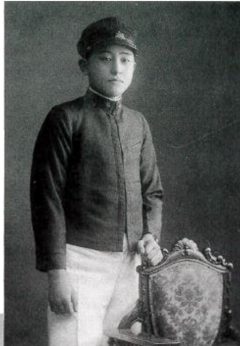
Before graduation from the junior high-school attached to Tokyo Higher Normal School (January 1932)