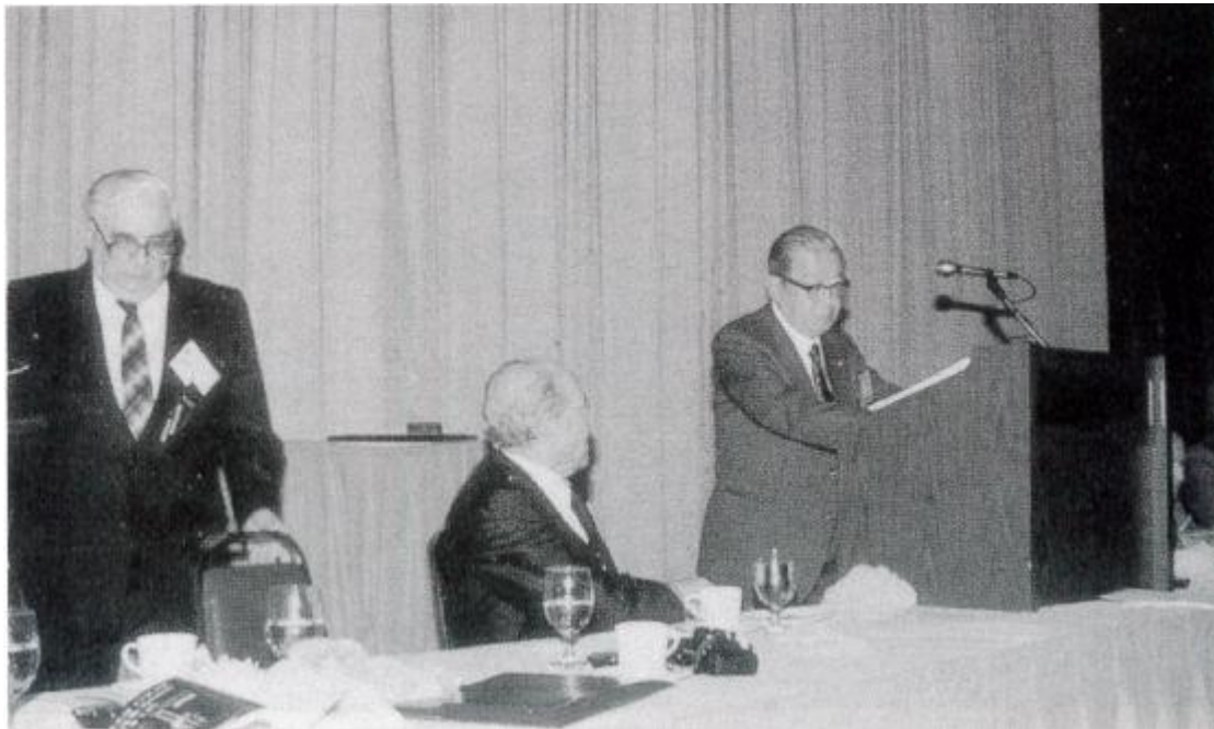
Awarded the Shewhart Medal from ASQC for the year 1982 (Boston, 1983)