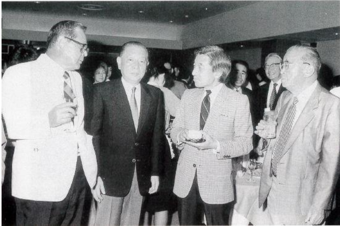
Having a conversation with Emperor, then Crown Prince(Kajimanomori, Karuizawa, August 1987)